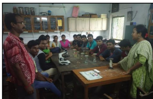
Biological Science Laboratories