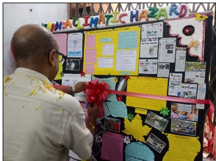
Department of Geography