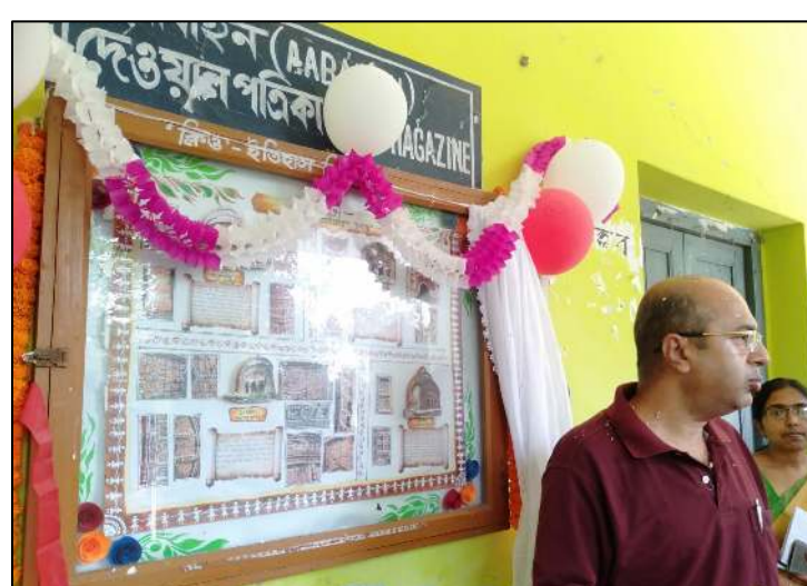
Department of History