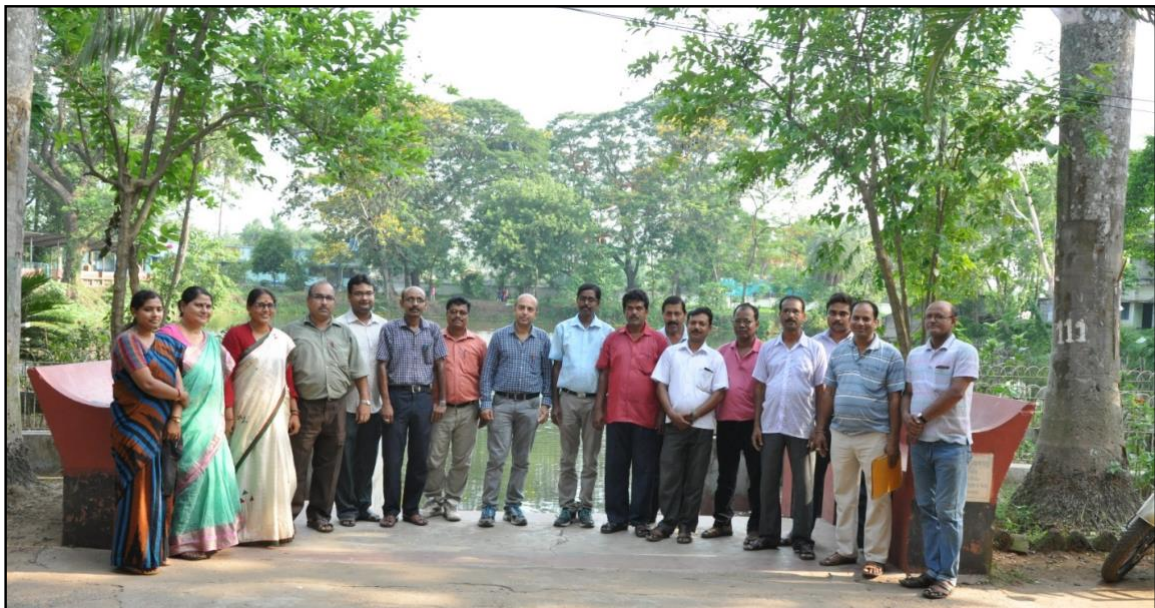
Teaching and Non Teaching friends