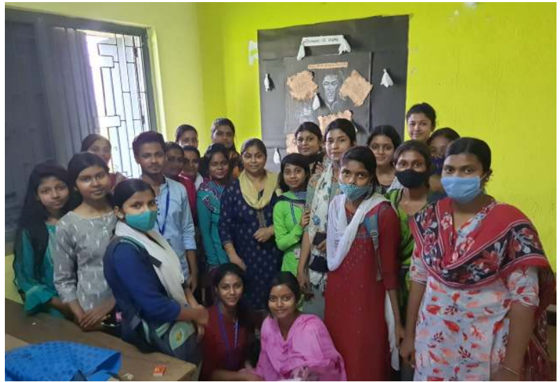
Department of English