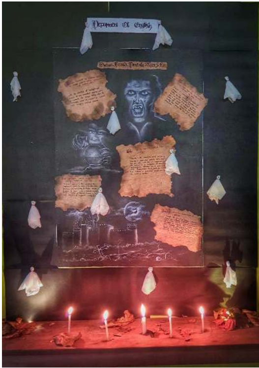
Chart and Model Presentation at Annual Cultural Programme